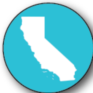
California Dec. 2015