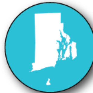
Rhode Island May 2016