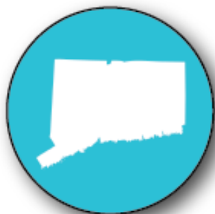
Connecticut May 2015